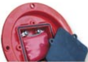
User-replaceable battery in sealed compartment.

The AV15 is also available with an optional ON/OFF switch for temporary installations such as worksites.