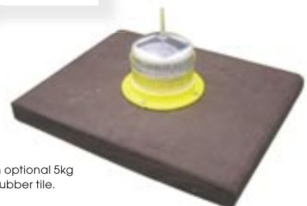
AV15 with optional 5kg non-slip rubber tile.