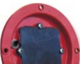
AV15 with optional ON/OFF switch.