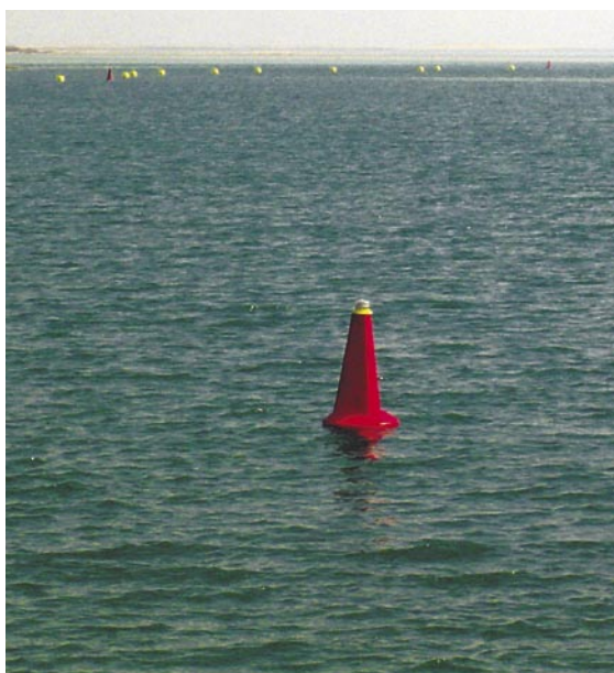
One of 165 units installed as perimeter marking, Saudi Arabia

The complete assembly is only 16kg (32.2lb). The unit is available in standard high visibility Yellow, Green, Red and White.