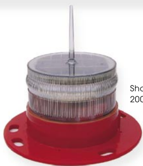
Shown with optional 200mm OD base pattern

The Sealite SL60 is the most popular and versatile 2nm solar marine light available. Made from tough, durable polycarbonate and using the latest high-intensity LED's, no expense has been spared in the design and development of this lantern.