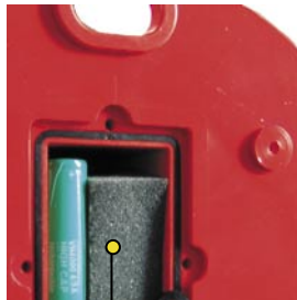
Battery access via sealed compartment